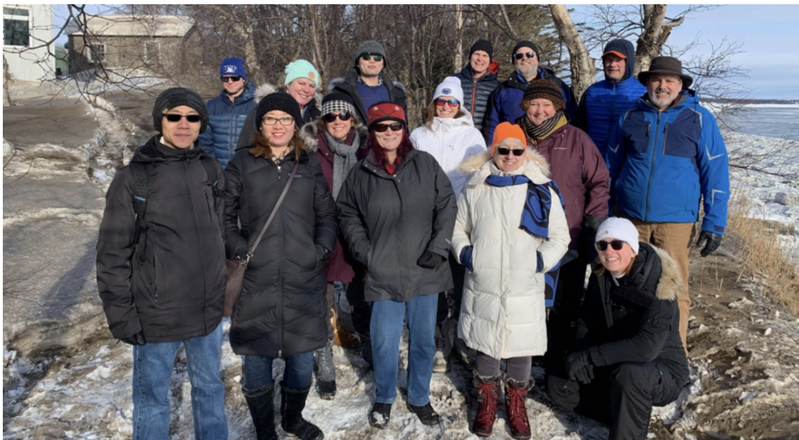
The POLARIS Team.

The POLARIS project seeks to understand how communities in Arctic Alaska are affected by environmental hazards and risks, including coastal erosion and flooding, declining sea ice cover, and changes in the availability and access to wild resources.