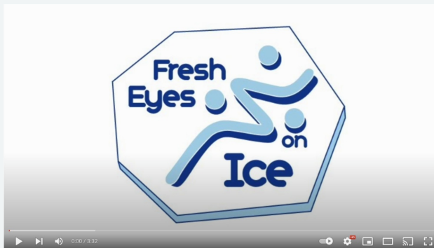
NNA Project Highlight: Fresh Eyes on Ice

Questions and comments can be directed to fresheyesonice@gmail.com .